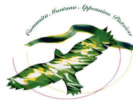
Comunità Montana Appennino Pistoiese

(Province of Pistoia, Official Tourism Board “Abetone, Pistoia, Pistoia Mountains” and the “Pistoiese Apennine” Mountain Community)