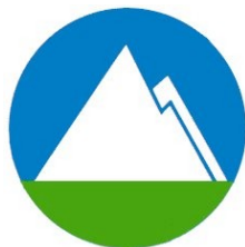
Agenzia Per il Turismo Abetone Pistoia Montagna Pistoiese